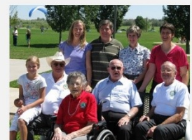
# 5, #14, #15, & #20 of 20 Children